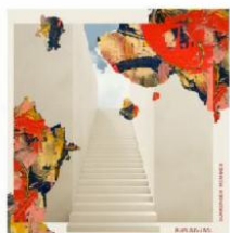
MUSIC RUFUS DU SOL